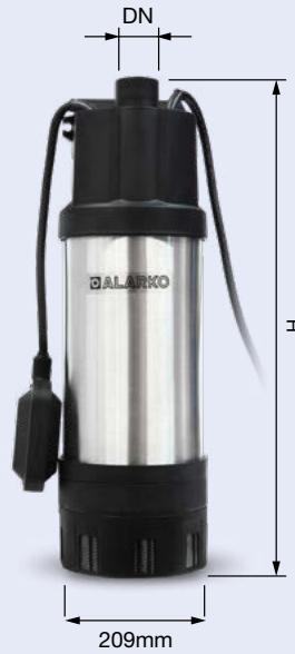
EC-TDS1000 MULTI INOX PARTS AND MATERIAL TABLE